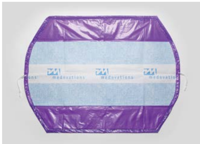
Edge-to-edge absorbent padding.

*Standards of Infection Control in Reprocessing of Flexible Gastrointestinal Endoscopes, SGNA © 2016