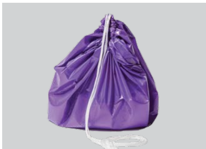
Pull cords around dirty endoscope to transport.